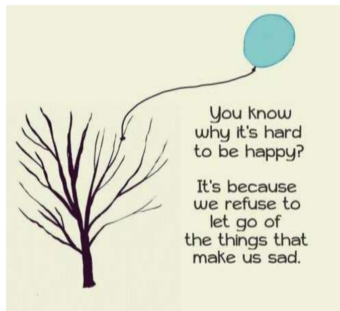
Figure 2: Message of acceptance

A point comes in life when the sense of temporary phase called life, transforms itself as a feeling of pain due to fear of death. Is there any way to come out from this state in order to get higher happiness state? The only way is self realization. Self realization means to have understanding about self existence. If you will have deep down thinking about yourself that you will realization about your eternal existence beyond this temporary body and mind. You will find that this sense and phase is temporary but you are temporary. I will suggest the readers to read about who am I to understand this completely. Finally after this realization you will have extraordinary acceptance towards reality and Acceptance of truth is the end of all sufferings. Suffering exists because of ignorance otherwise there is no suffering in this world.