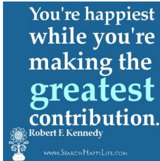
Figure: Contribution and Happiness

use. Real purpose of life lies in its utilization. When you contribute something for the welfare of society/world. It gives very deep feeling of joy/happiness.