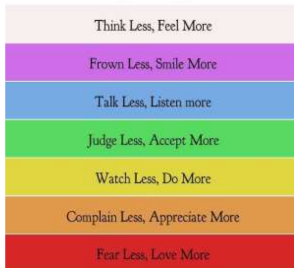
Figure 1: General steps of happiness