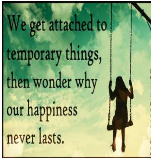
Figure: Happiness and temporary pleasures

During our research, various interview sessions are conducted at different part of uttrakhand. Stage 1 of happiness belongs to instant pleasure for example if an addict wants smoking, then that person want to take that pleasure at once. Happiness comes in this stage but it is short term.